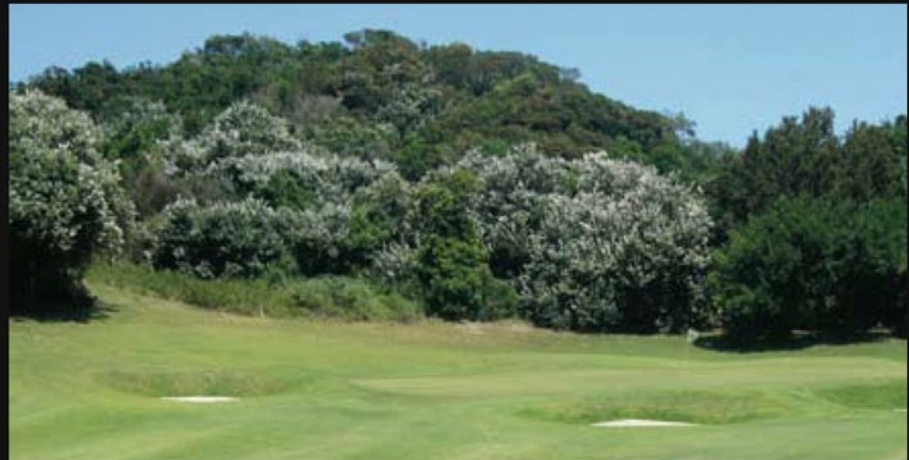
The 8th hole at East London Golf Club