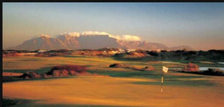
The view of the 18th hole at Atlantic Beach Golf Estate.