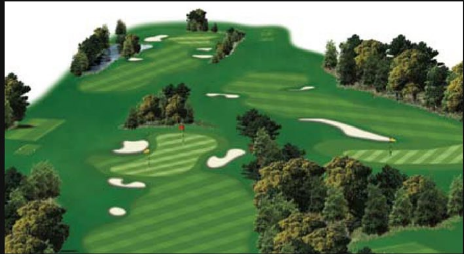
Graphic produced for the New Metropolitan Golf Club (Client – the City of Cape Town)